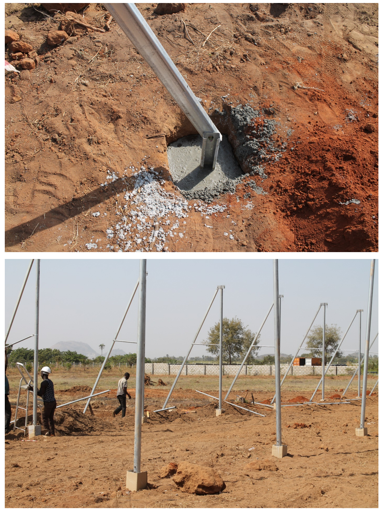
The installation process for the Greenhouse